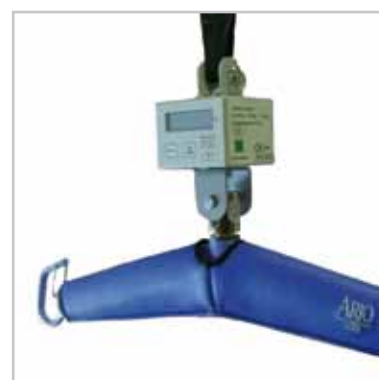
Class 3-approved scale, used here on a 2-point spreader bar.