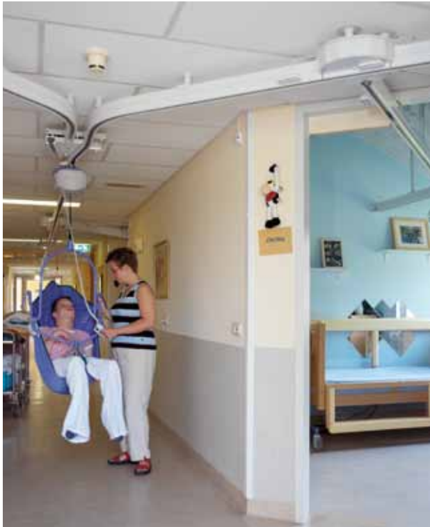
The exchanger and turntable enable a variety of different track solutions.