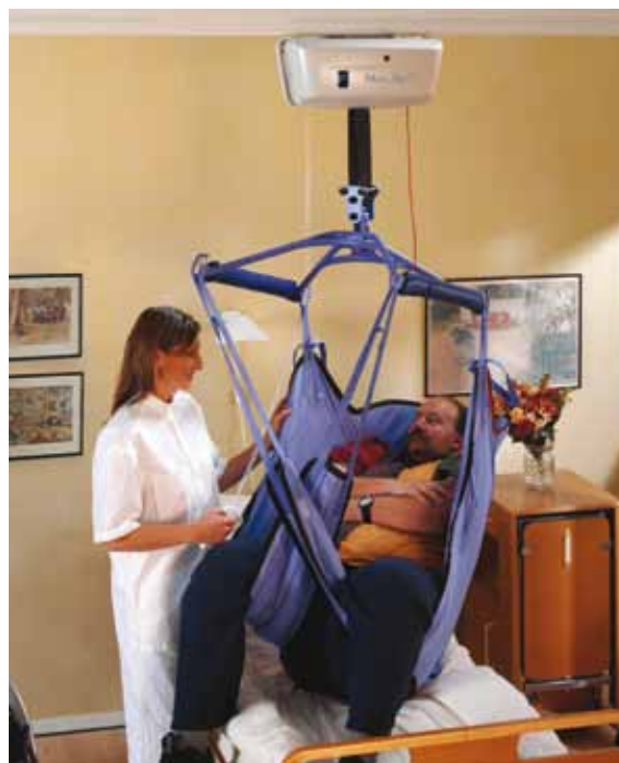
There is a full range of Maxi Sky ceiling lifts that includes a portable lift, Maxi Sky 440 , with a safe working load of 200 kg (440 lbs) and, pictured here, Maxi Sky 1000 , which is designed to handle bariatric patients, and has a safe working load of 455 kg (1000 lbs).