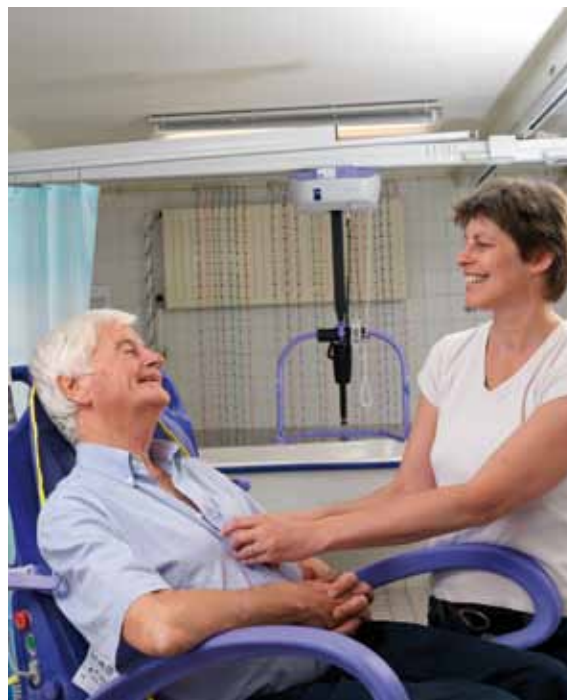
When full-room coverage is required, the X-Y (traverse) system is an ideal choice. With the unique traverse action, the track moves very easily with no risk of jamming. Here, it is used with an ArjoHuntleigh curtain to provide a high degree of privacy.