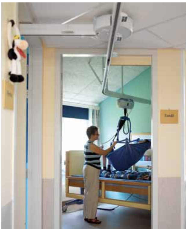
A turntable provides a choice of directions outside the resident's room.

Maxi Sky 600 can continue on a different track after passing the exchanger.