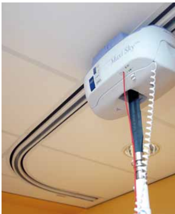
The track can be partially concealed in a suspended ceiling to provide a discreet solution.