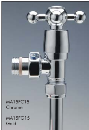
MA15FC15 Chrome MA15FG15 Gold