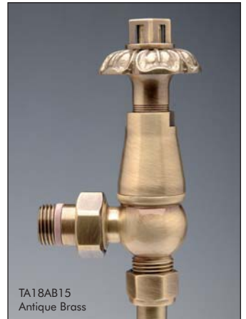
TA18AB15 Antique Brass