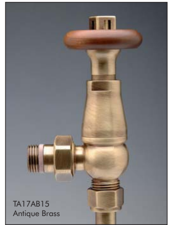
TA17AB15 Antique Brass