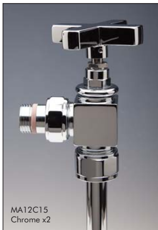
MA12C15 Chrome x2