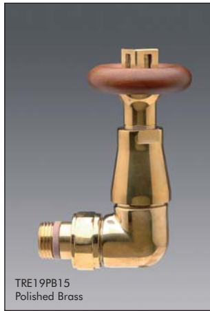
TRE19PB15 Polished Brass