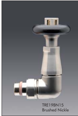
TRE19BN15 Brushed Nickel