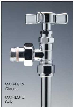
MA14EC15 Chrome MA14EG15 Gold