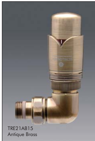
TRE21AB15 Antique Brass