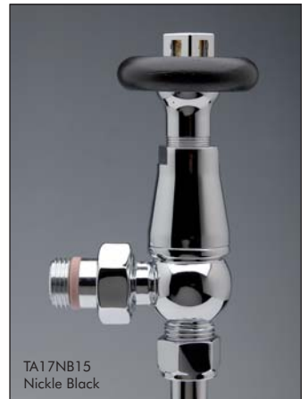
TA17NB15 Nickel Black

When ordering valve sets please check that the correct product codes are used, preferably with a description.