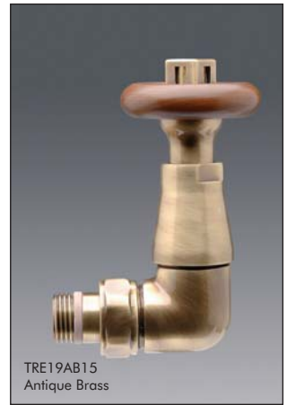
TRE19AB15 Antique Brass