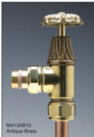
MA13AB15 Antique Brass