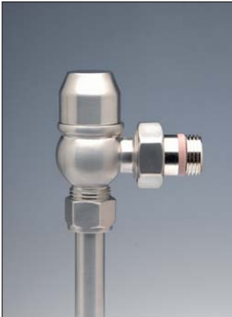
TA17BN15 Brushed Nickel