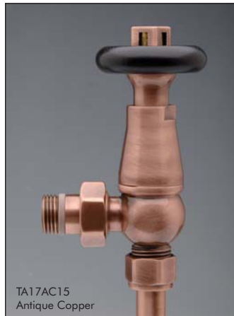
TA17AC15 Antique Copper