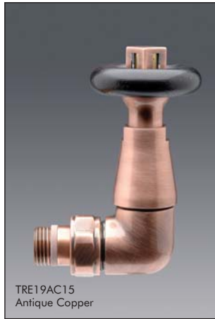
TRE19AC15 Antique Copper