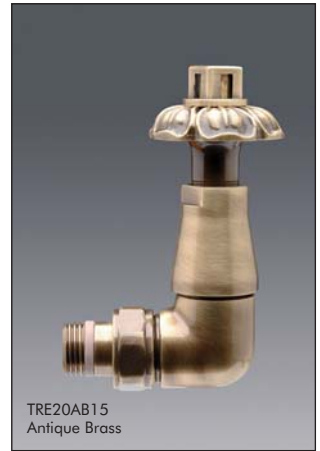
TRE20AB15 Antique Brass