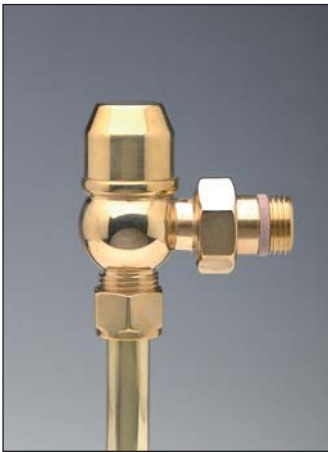
TA17PB15 Polished Brass